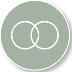
Marriage and civil partnership pg 11