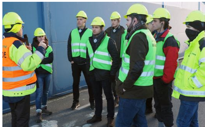
Euroforester students on a visit to Derome in Varberg, a sawmill with extensive processing.