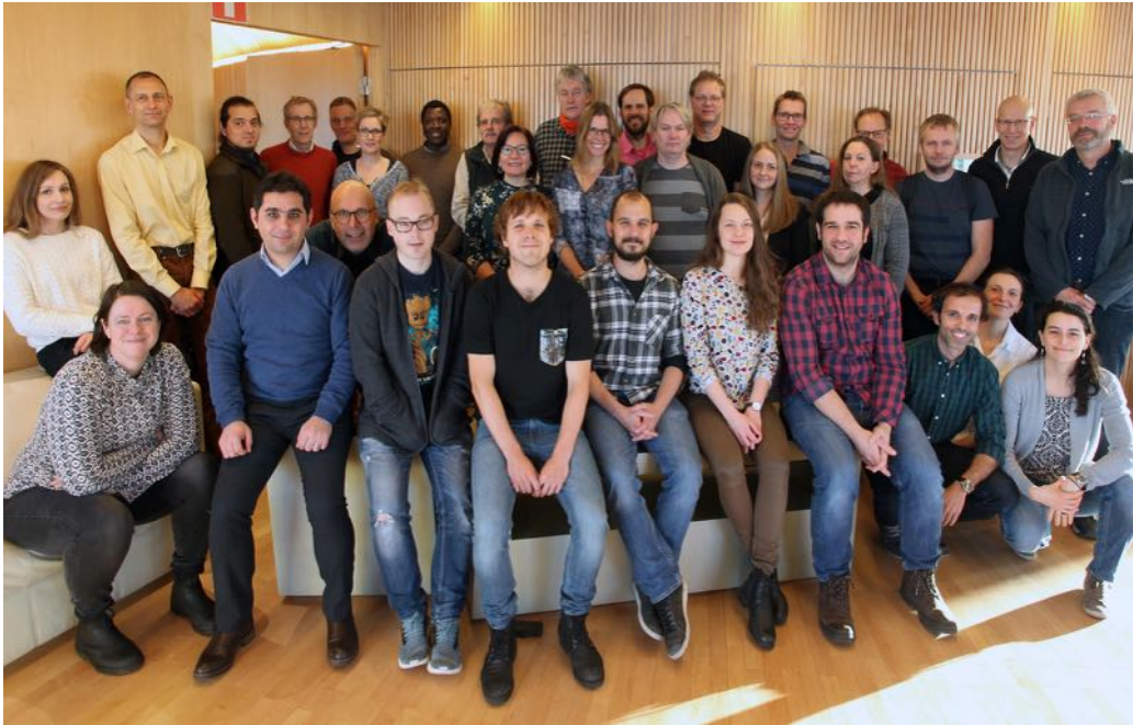
At the beginning of 2019, the department had 51 employees. This picture shows the participants at the institution day in January 2019.