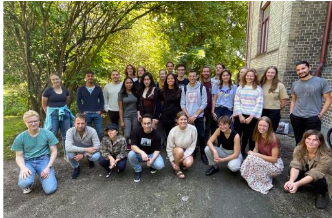
The start of the term in Forest & Landscape

"Not least is it a great opportunity for graduates of the Skogsmästare program