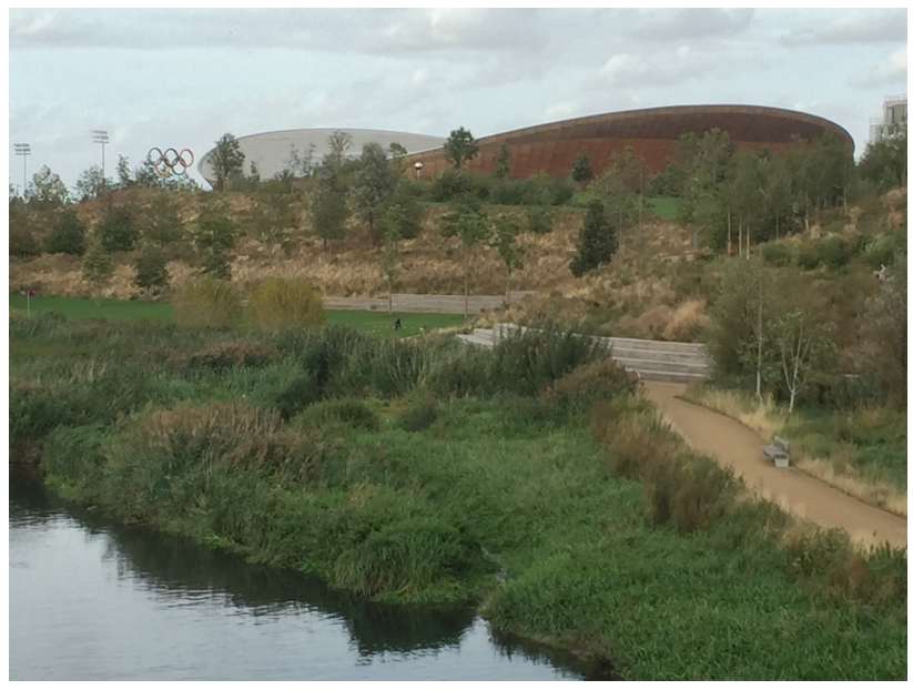
Queen Elizabeth Olympic Park, London, UK