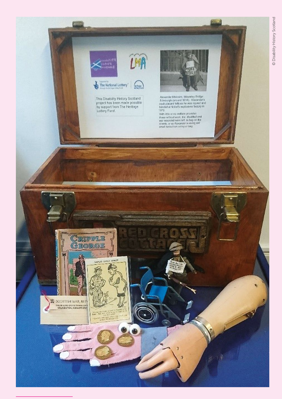
Figure 4 A Memory Chest that used physical artefacts to provide insight into the disability movement.

CONNECTED COMMUNITIES | Foundation Series 37 Collaborative research: History from below