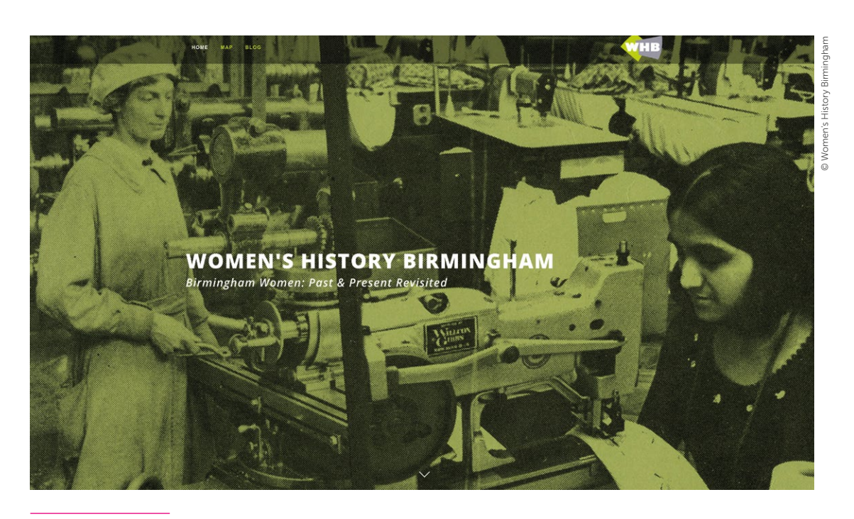
Figure 3 Home screen of the Women's History Birmingham website.