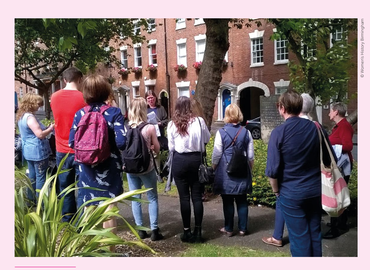
Figure 2 A walk led by Women's History Birmingham inspired by the Feminist Review sponsored walk in the 1980s.