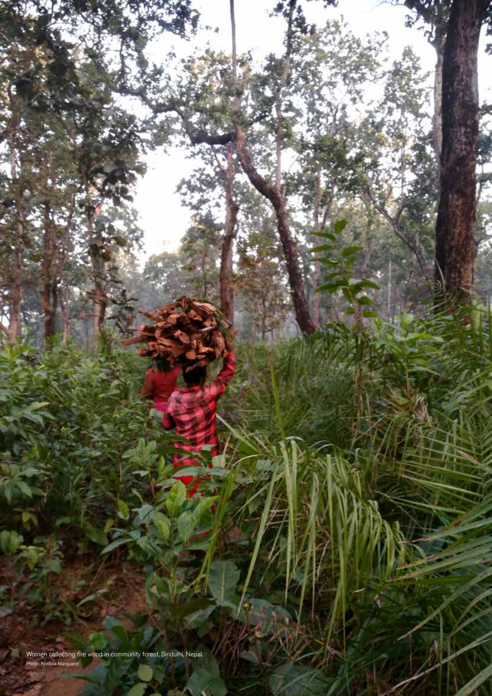
Women collecting fire wood in community forest, Sindulhi, Nepal.