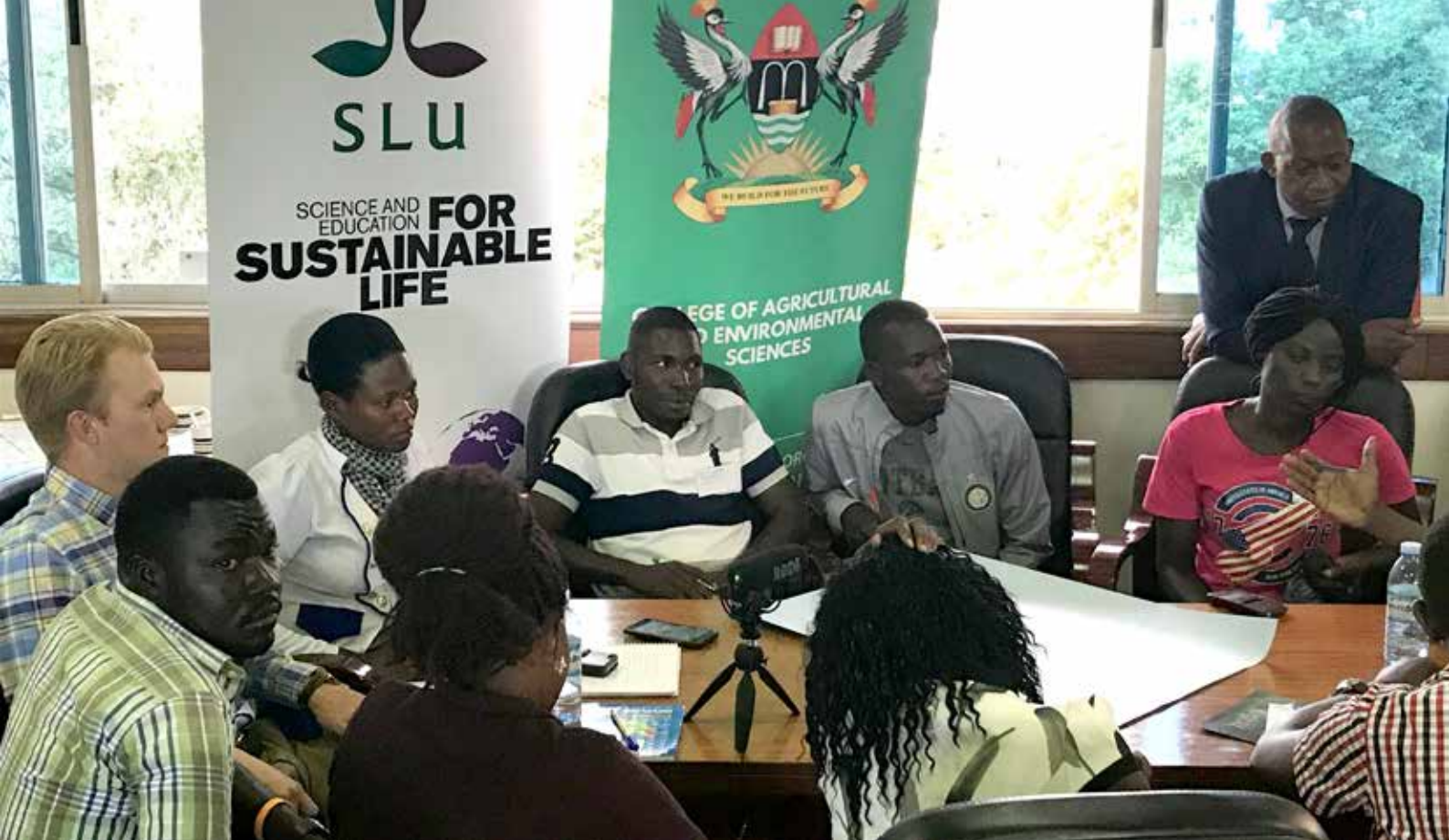
In August 2017, SLU visited Uganda to explore possible educational and research collaborations between SLU and partners in Uganda (Makerere University, Gulu University, and Uganda Martyr's University) and institutions (RUFORUM, RUCID, FAO). This precipitated in an Accelerate incubator workshop in which students and teachers from Sweden and Uganda collaboratively developed agribusiness ideas.