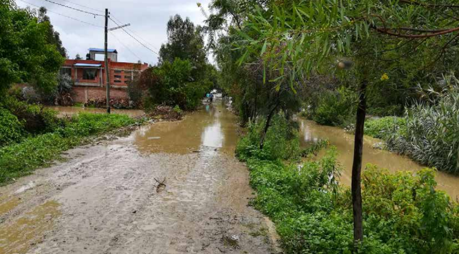
Flooding in Cochabamba, Bolivia, due to the intensive construction taking place on arable land. Shows how vulnerable society is.