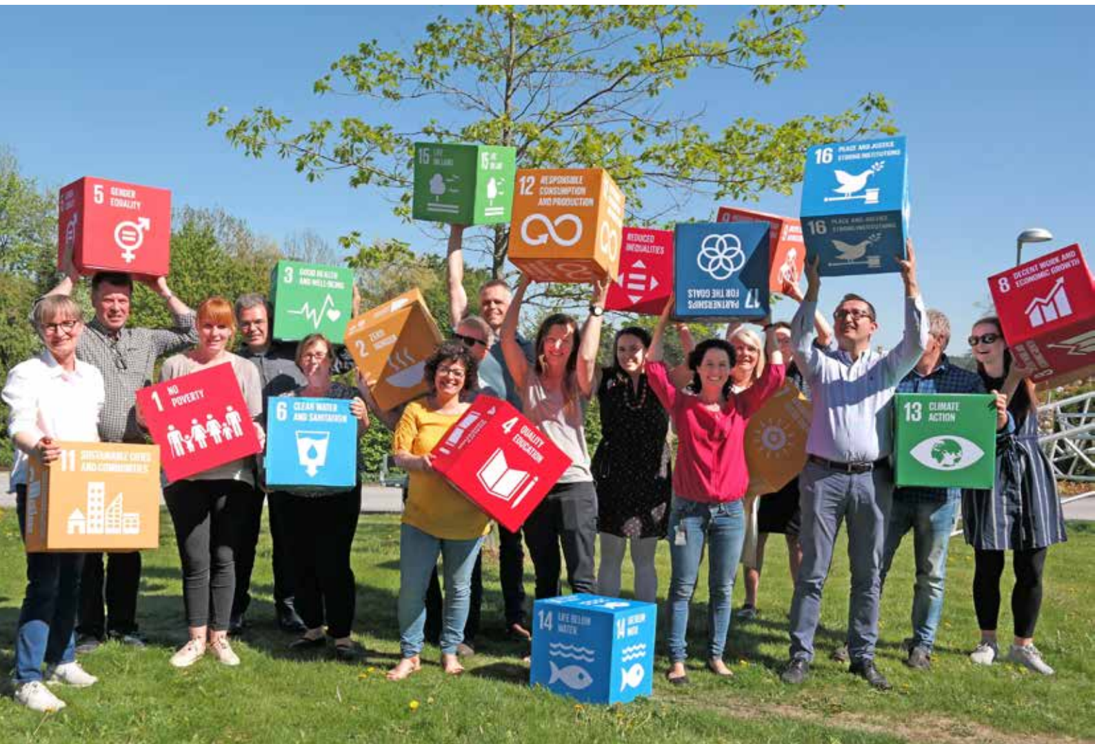
The United Nation's Sustainable Development Goals of the Agenda 2030 at the SLU campus Ultuna.