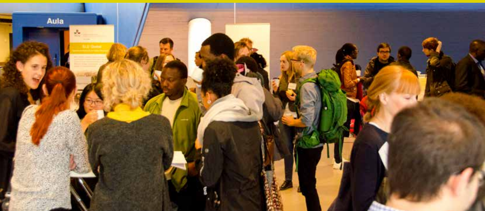
Participants in the Agri4D 2017 conference.