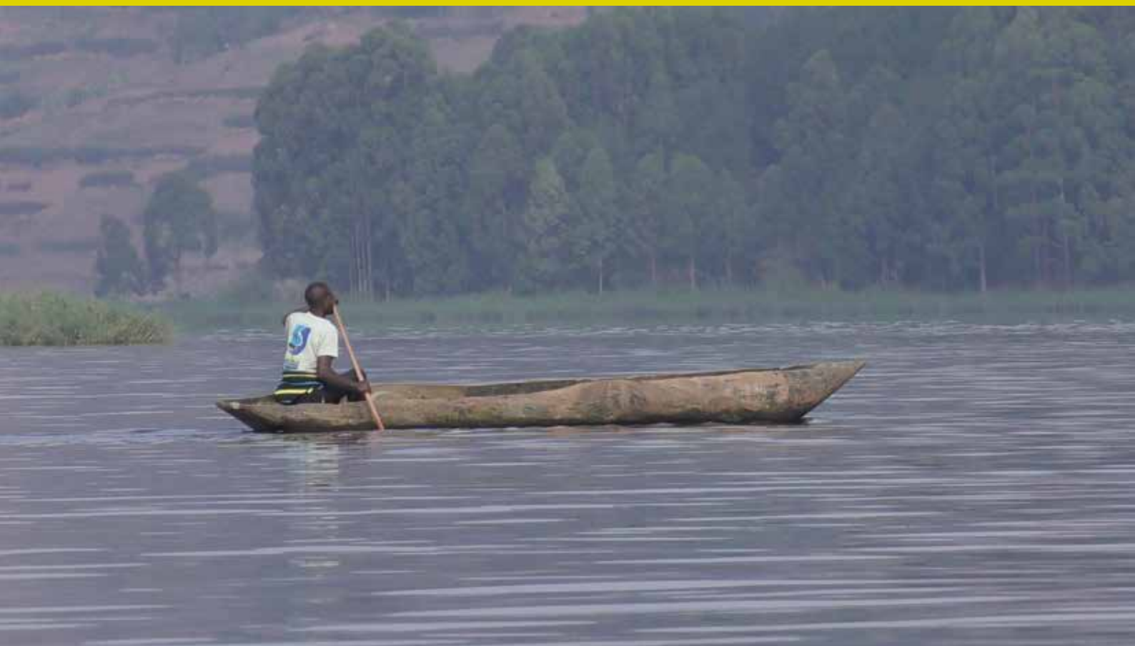
Wooden canoes are used for transportation across the Lake Bunyonyi in southwestern Uganda.