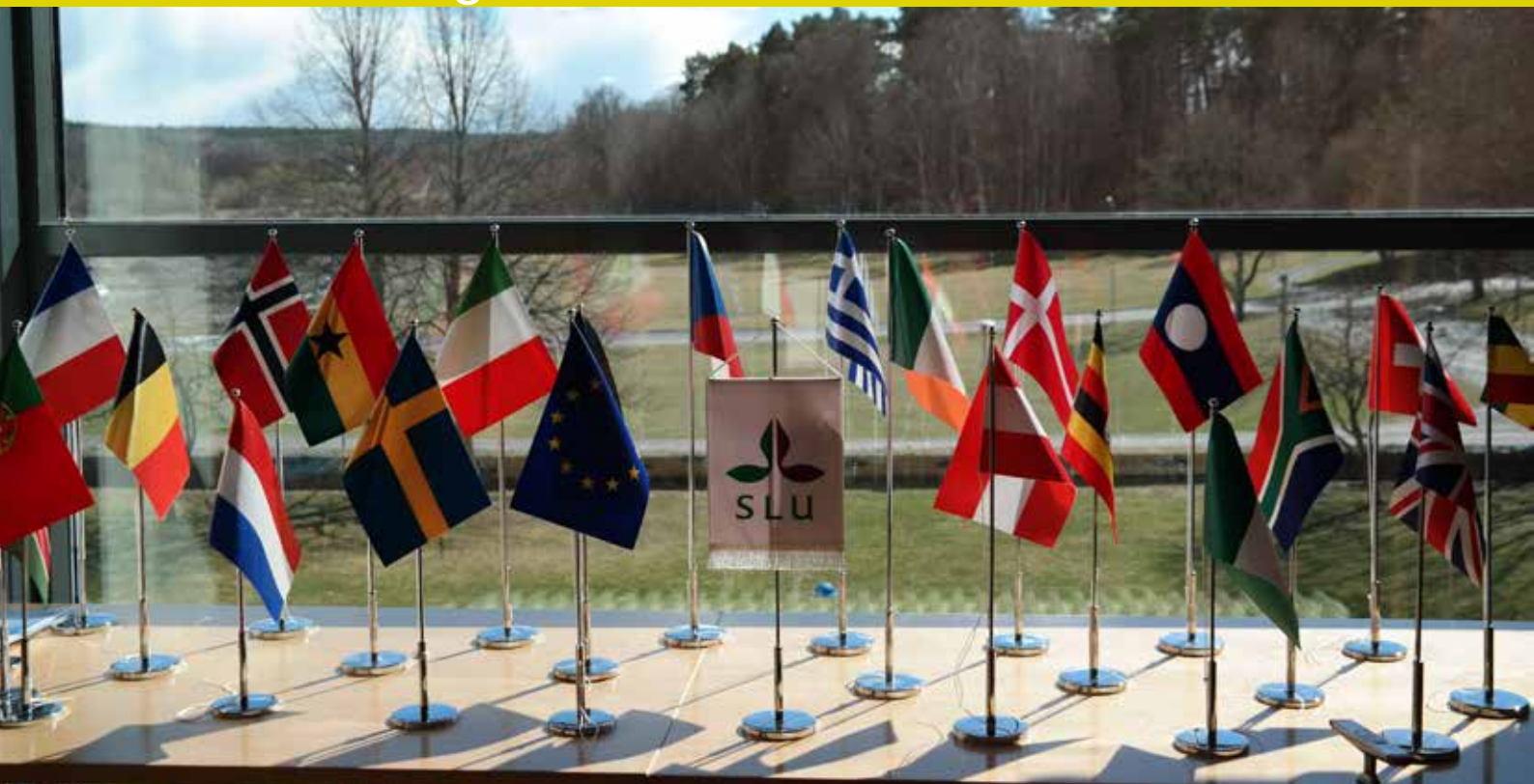
Flags from all participating nations in the Agrinatura General Assembly, April 2017.