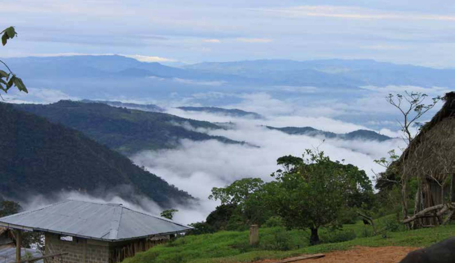
Early morning in the village Nuevo Lamas, San Martín, Peru.