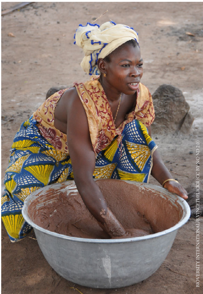
Young woman processing shea nuts