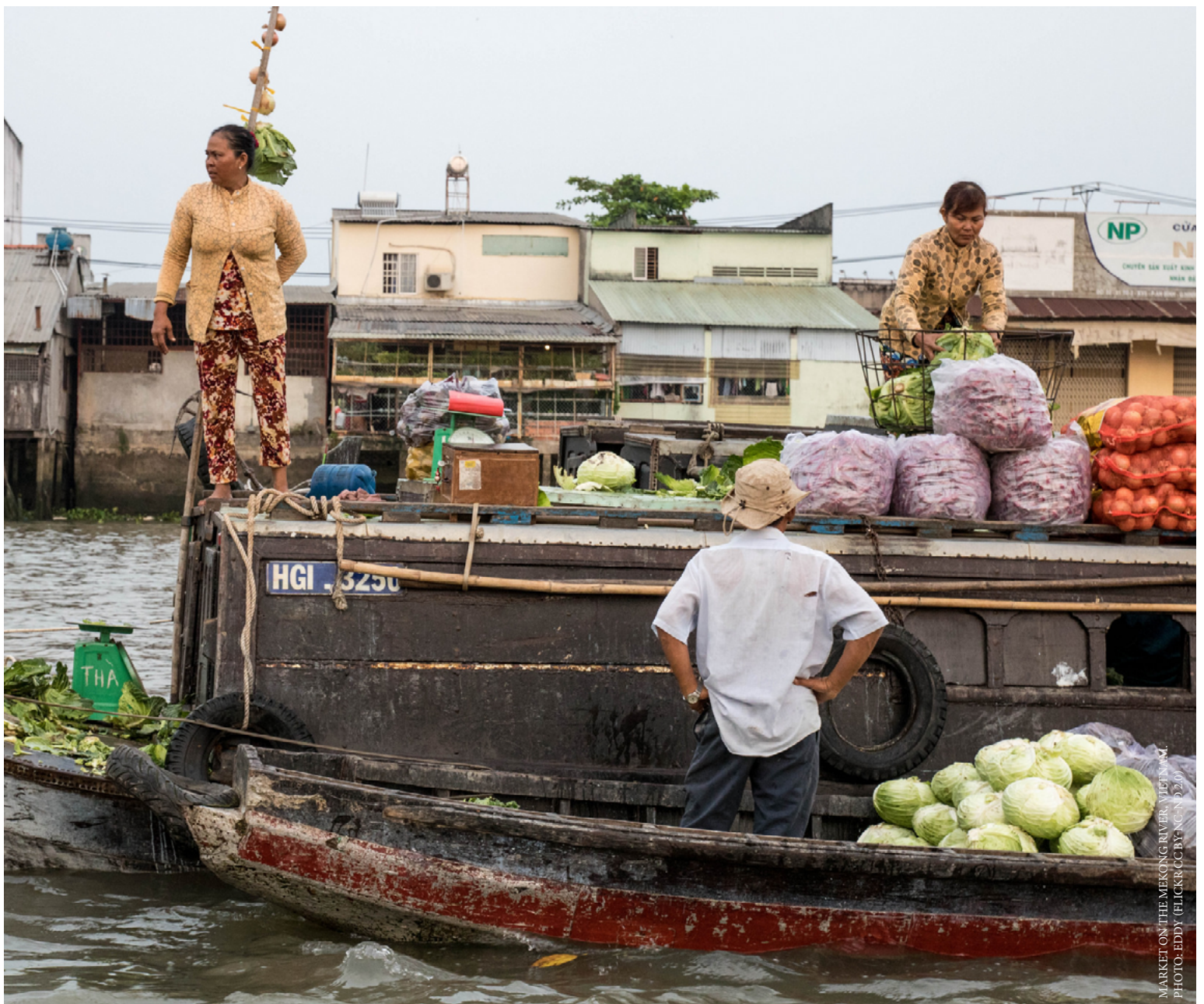
MARKET ON THE MEKONG RIVER, VIETNAM.