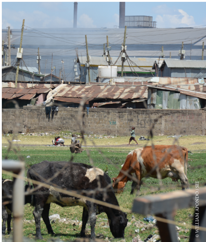
Livestock in Nairobi's informal settlements.

The results of the project will soon be published in the form of a peer-reviewed journal article. Moreover, a workshop, "Livestock systems in urbanized environments: implications for food security", will be organized in September 2018 to validate and disseminate the review results to a larger audience of researchers and stakeholders.